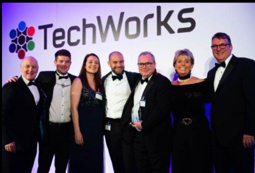
Manufacturing Site of the Year Award Won by: Diodes