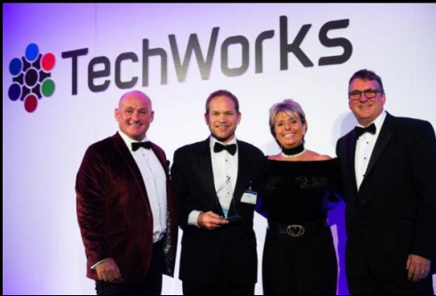
Innovation Award Won by: Nanusens