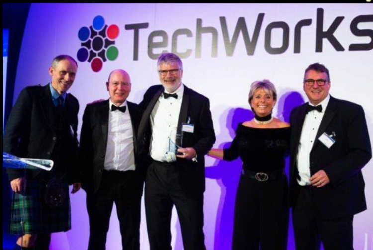
Automotive Electronics Innovation & Excellence Award Won by: Blu Wireless