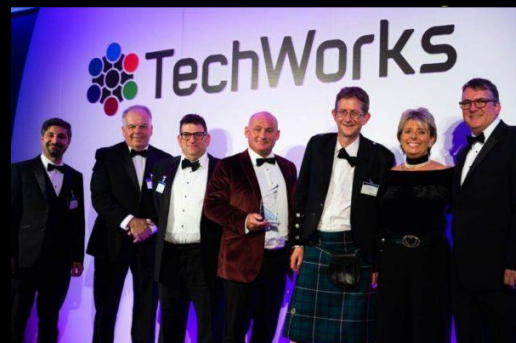
R&D Excellence Award Won by: CSA Catapult