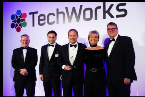
Emerging Company of the Year Award Won by: Nanusens