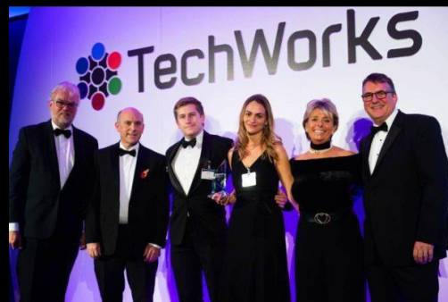
Product of the Year Award Won by: Darktrace