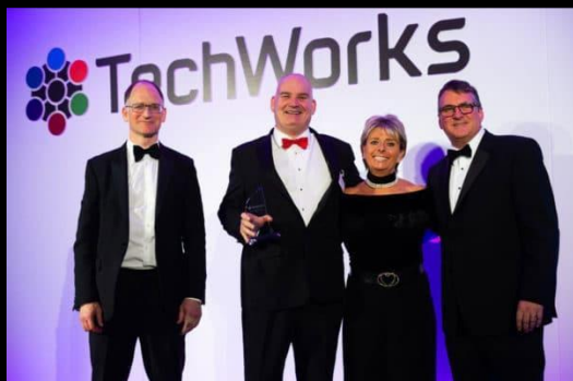
Company of the Year Award Won by: Secure Thingz